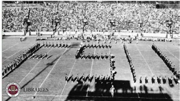
Highlights of our virtual backgrounds!